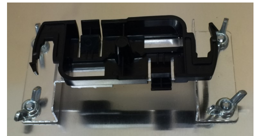
Integrated Mounting Plate Shown with AP Supplied Ceiling Tile Clip